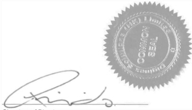
Signature of Director

for and on behalf of DIGINEX ) SOLUTIONS (HK) LIMITED )